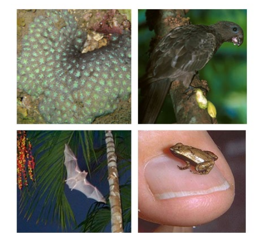
Fig. 1: 4 of the 12 Seychelles EDGE species

IN-COUNTRY CHALLENGES : To fulfil their commitment to the CBD, the Government of Seychelles' Ministry of Environment, Energy and Climate Change (MEECC) is tasked with saving these species, some predicted to be only a decade from extinction. However, the Ministry has identified